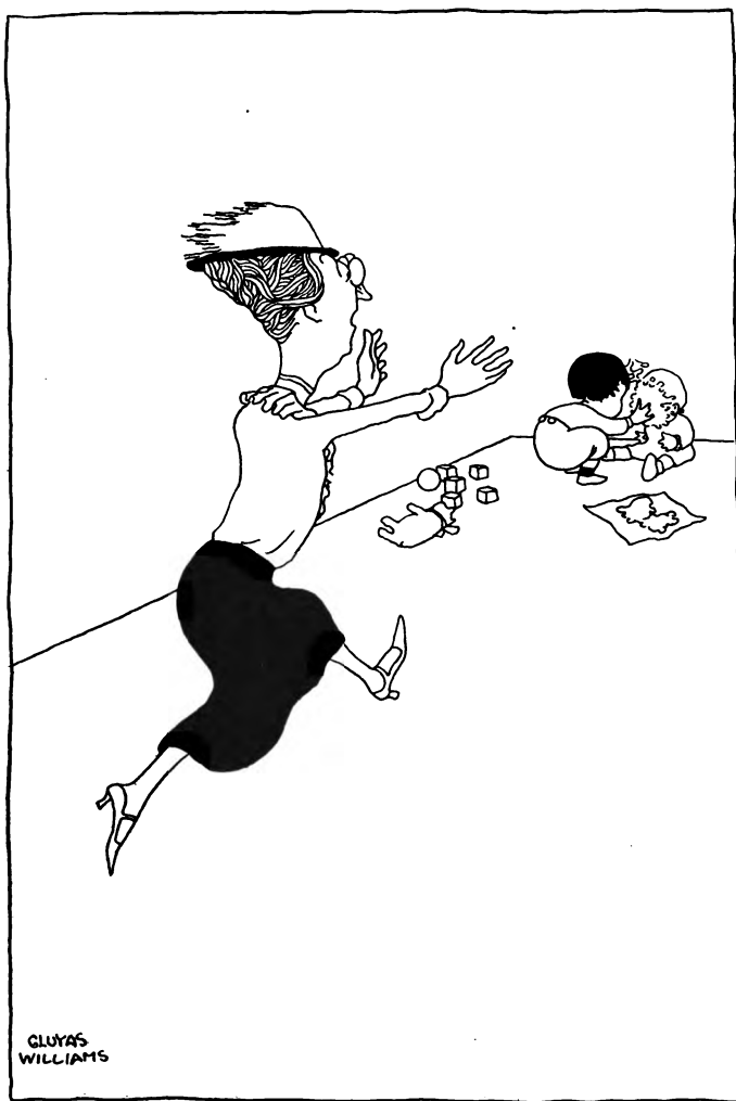
Mrs. Deemster didn't enter into the spirit of the thing at all.